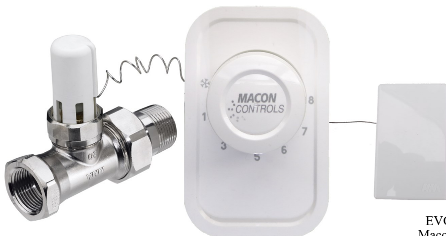
EVOLZ shown with Macon NT series valve (sold separately)